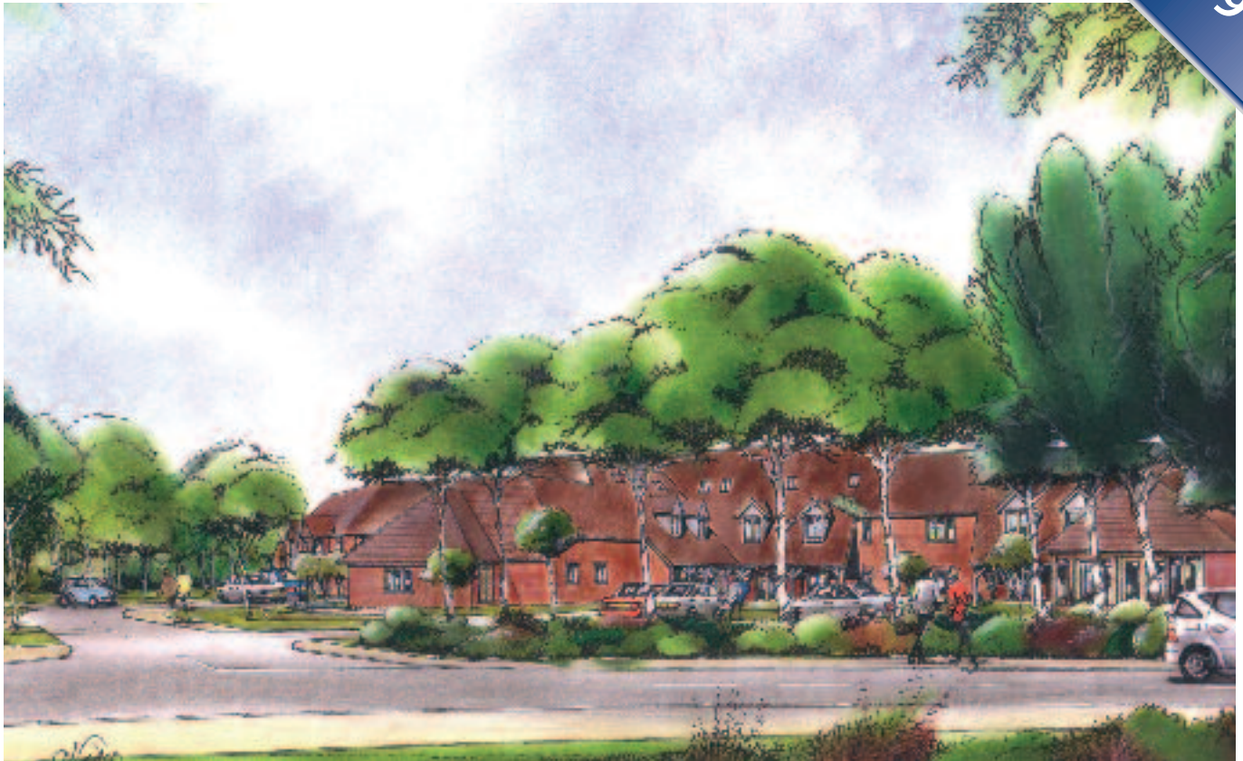
SONNING COMMON – Reading, Berkshire

As one of the largest independent care homes groups in the UK, Caring Homes has an experienced development team which provides exceptional homes to meet the specific needs of our residents.