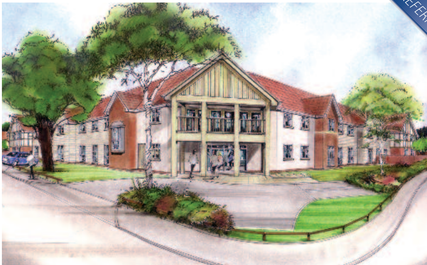
RENDELSHAM CARE CENTRE – Woodbridge, Suffolk

As one of the largest independent care homes groups in the UK, Caring Homes has an experienced development team which provides exceptional homes to meet the specific needs of our residents.